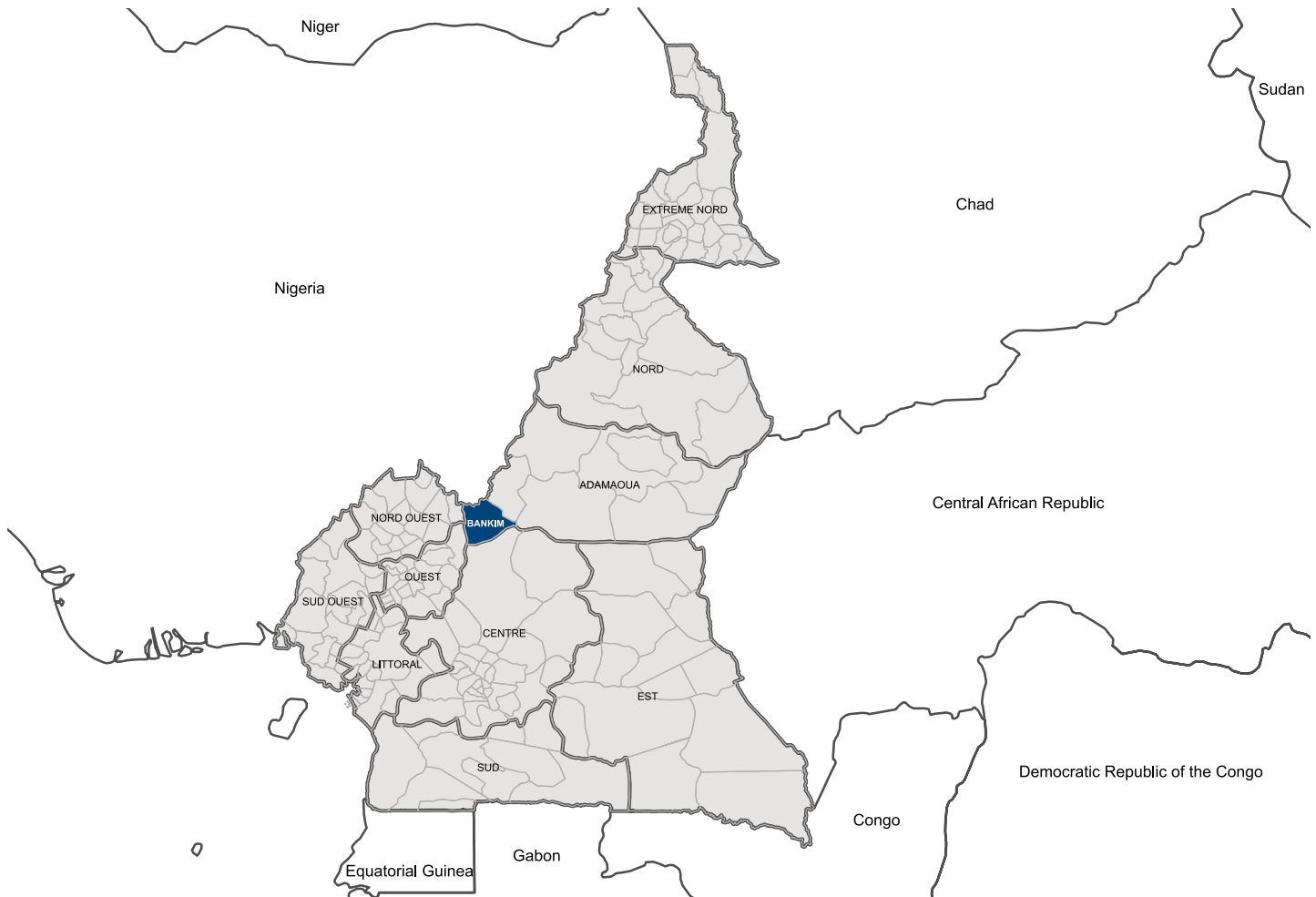
Fig 1. Map of Bankim district, Cameroon.

https://doi.org/10.1371/journal.pntd.0005557.g001